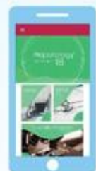
Hepatology Con 2018