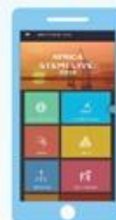
Africa Stemi Live