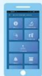
KMA Annual Scientific Con