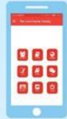
Pakistan Cardiac Society