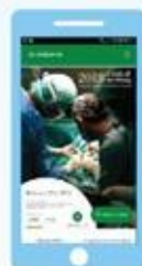
AKU Surgical Meeting